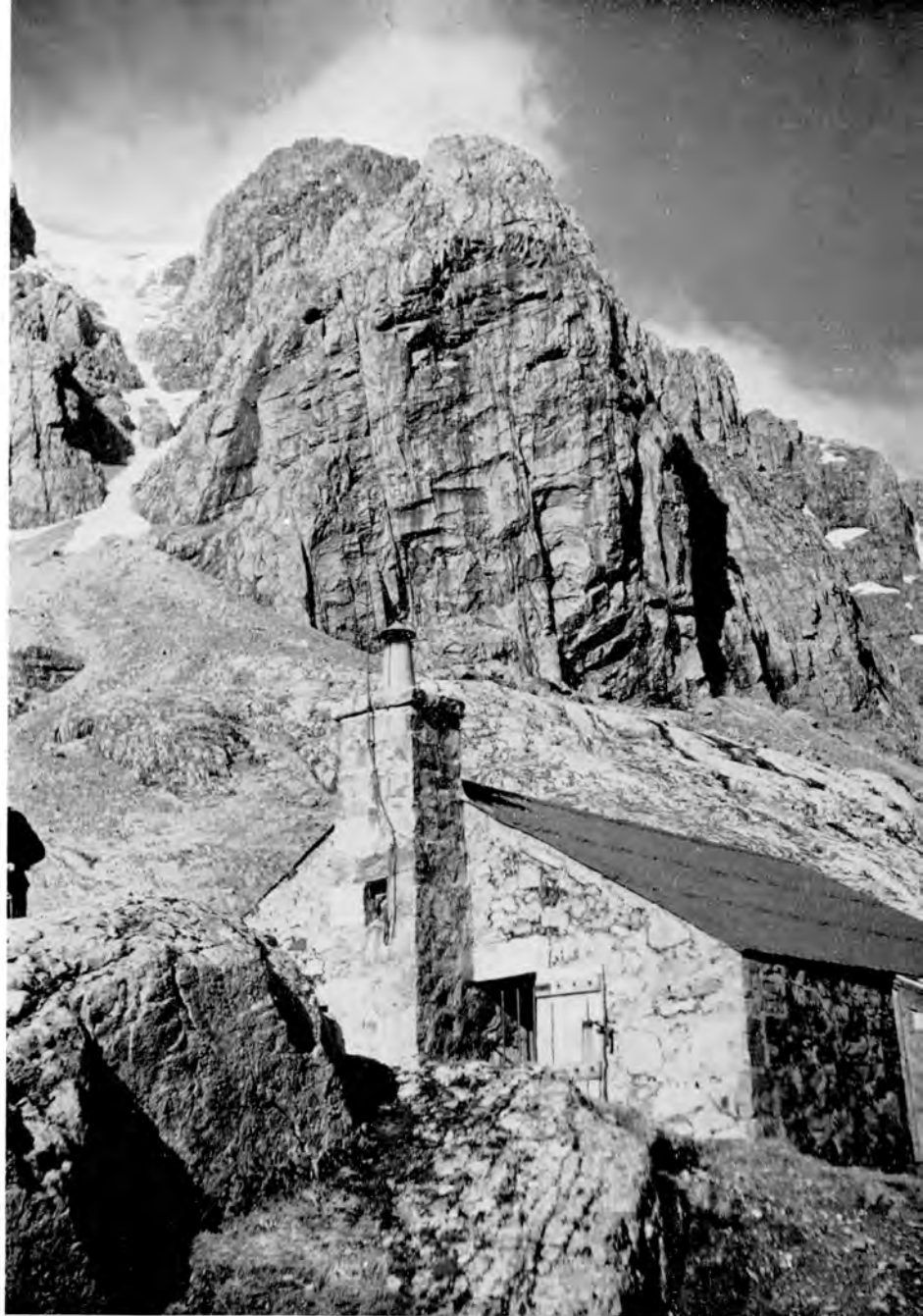
The C.I.C. Hut, Ben Nevis.